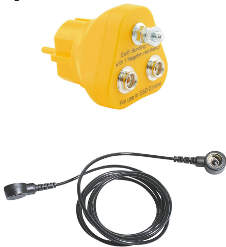
ESD ERDUNGSLEITUNG ESD GROUNDING CABLE